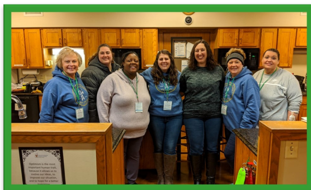
Eta Pi members volunteering at the Ronald McDonald House