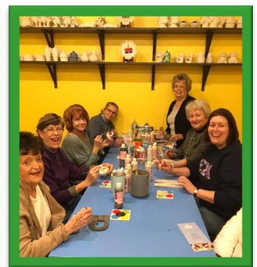
Gamma Pi enjoying a fun evening out at uPaint Pottery Studio.