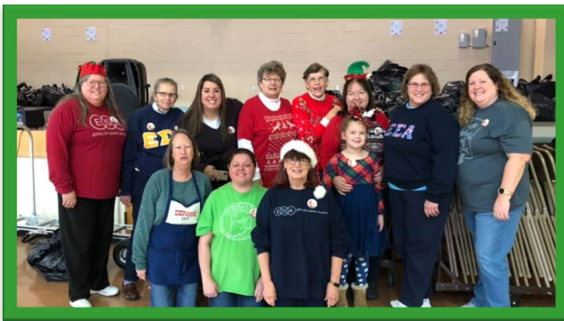
Gamma Pi and Alpha Delta members wrapping presents for the kids at Damar.

In February we participated in a Chili Cook-off to benefit Relay for Life. We hosted our Annual Reverse Raffle on February 22nd to support Camp Riley! This is our biggest Gamma Pi hosted event of the year. It included a spaghetti dinner, lots of dessert, raffle tables, and much more!! We look forward to seeing what all of our other ESA Chapters are doing and we send all of our support!