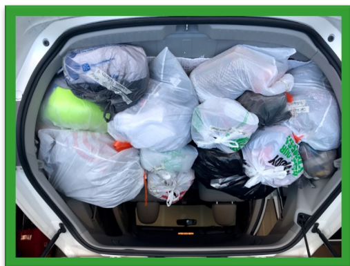
Eta Pi delivering 460 pounds of clothing for Hope for Heroes