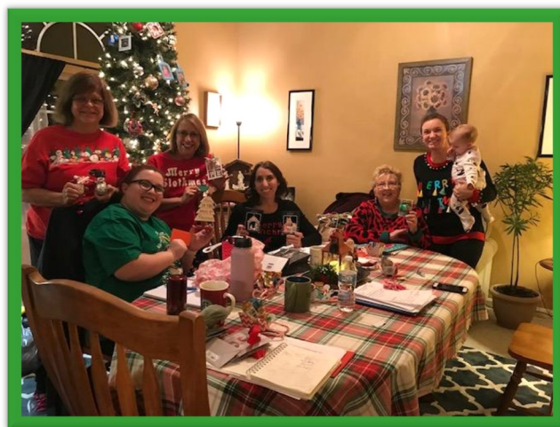
Delta Kappa Chapter Christmas Party