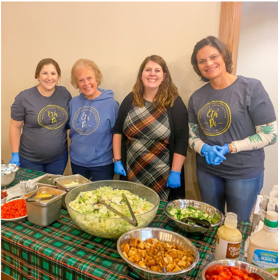
Eta Pi serving a meal at Ronald McDonald House