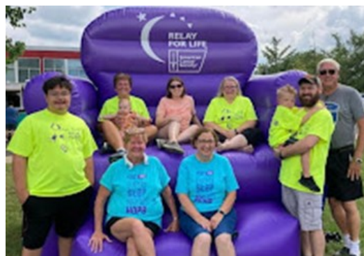
Relay for Life