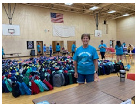
Rock n' Ready