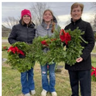
Wreaths Across America