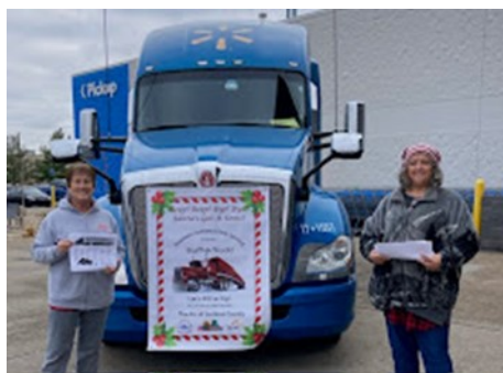
Stuff A Truck