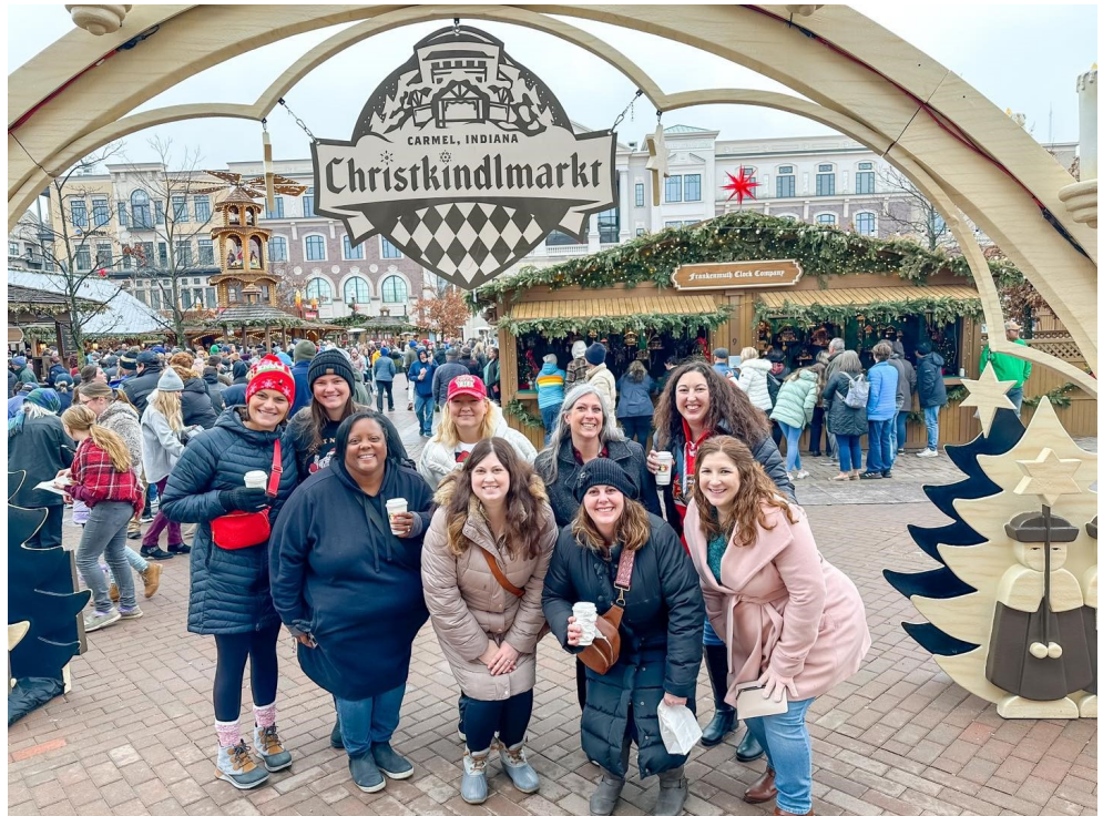
Fun holiday outing!