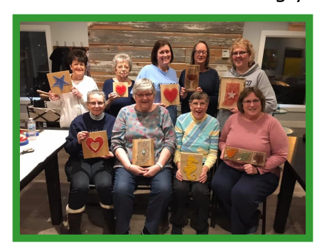
Gamma Pi enjoying a fun evening making String Art.

Gamma Pi sisters are sending you all of our love during these hard times!