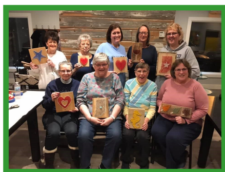
Gamma Pi enjoying a fun evening making String Art.

Gamma Pi sisters are sending you all of our love during these hard times!