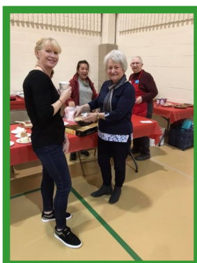
Gamma Pi at the Reverse Raffle benefiting Camp Riley